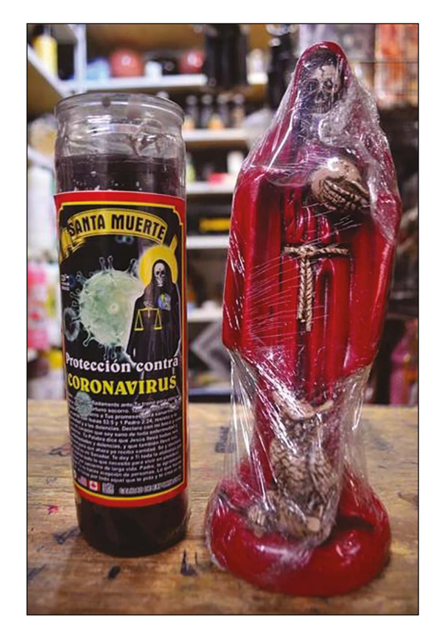
Figure 1: Coronavirus votive candle for healing and protection, alongside statue of Santa Muerte.

The folk saint's adaptability to the current COVID-19 crisis as doctor death is evident in the paraphernalia currently sold in Mexico. A coronavirus candle with Holy Death's image on it features the wording " protección contra coronavirus " (protection from coronavirus) and an invocation to the folk saint. Verónica Lezama is the owner of a store called Productos Esotéricos San Gabriel that offers esoteric products in Villahermosa, Tabasco. She reported that the Holy Death coronavirus candle has been a top seller lately (Figure 1). There are two options, Verónica detailed. Either one can buy the candle on its own or as part of a coronavirus kit that includes balm and a lotion. The candle wax, she detailed, should be inscribed with the name of the person requiring protection or suffering from COVID-19. The ailing person should then rub the candle all over their body before lighting it. The balm is to be applied to the skin. The lotion is to be dispersed at entrances to safeguard the inside of a home or a business from coronavirus.