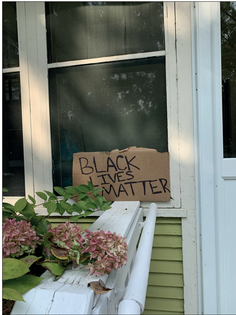
While I am inside debating my role, this poster, standing for the activism I believe in, sits outside.

11 July 2020. As if a pandemic and rigorous pre-med coursework were not enough to handle, news broke of the murder of George Floyd at the end of May 2020. Murdered just 81.3 miles from my house, Floyd's death has ignited conversations and protests against police brutality across the world. As an activist, Woman of Colour, and essential healthcare worker, I'm conflicted. As an advocate, I'm urged to join my community and (quite literally) stand up to the racist systems that aid and abet police brutality. However, a pandemic is raging, and I work with people at high risk of adverse outcomes if they were to contract COVID-19. How do I advocate for the dismantling of racist systems that are killing people without risking the lives of the people I work for?