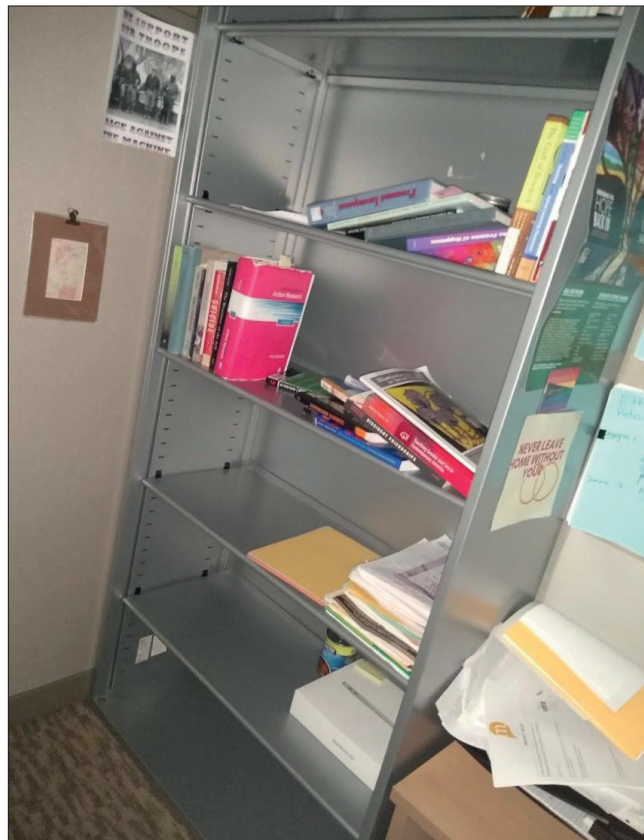
Past lives.